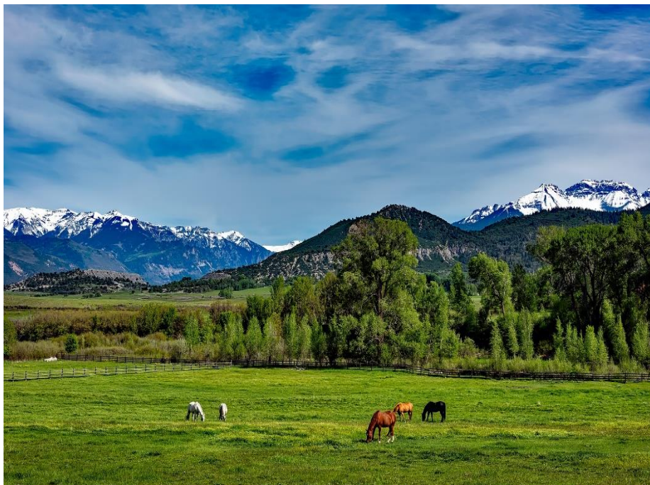
As you can see, the high peaks are dusted with snow while the lower elevations are spring-green. The tall trees indicate a river is probably nearby.