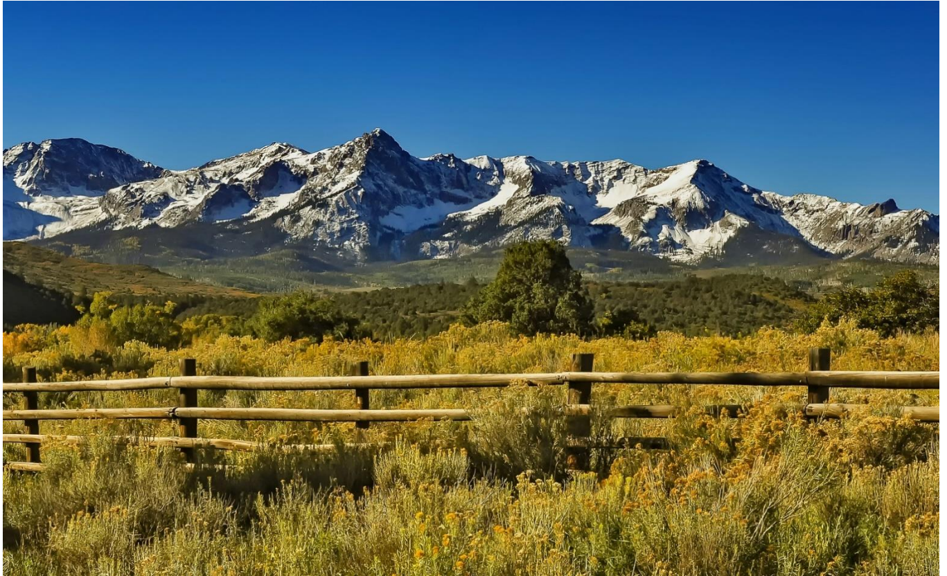
Areas on the ranch that are not irrigated are 'dry land' where vegetation includes rabbit brush and native plants that do not need much moisture to survive.